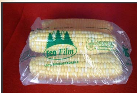
Eco Film Ready for Freezer Storage