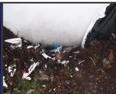
Plastic Contaminating Compost